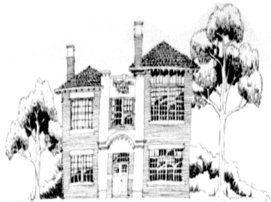
HARTWELL PRIMARY SCHOOL 4055